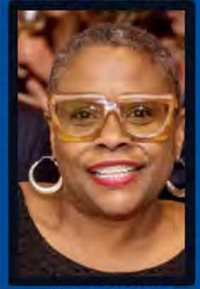
Class of 1986

As King and Queen contestants of the National Alumni Association SAU 2022 Competition, you have worked diligently to raise scholarship funds for Saint Augustine's University students.