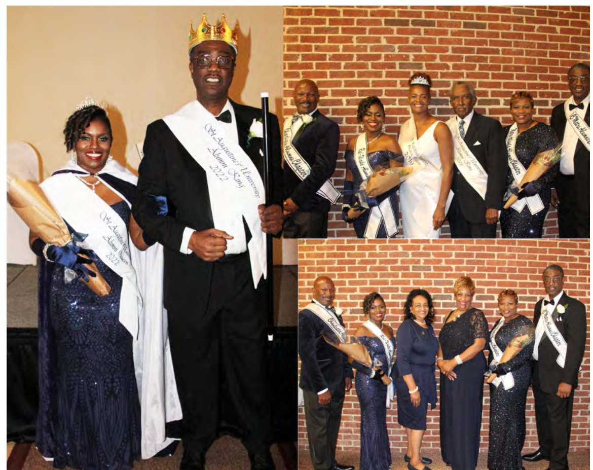
With gratitude and Falcon Love,