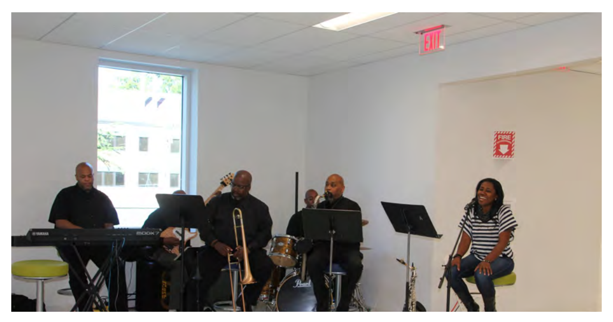
SAU Alumni Jazz Band featured at the Honors Jazz Brunch