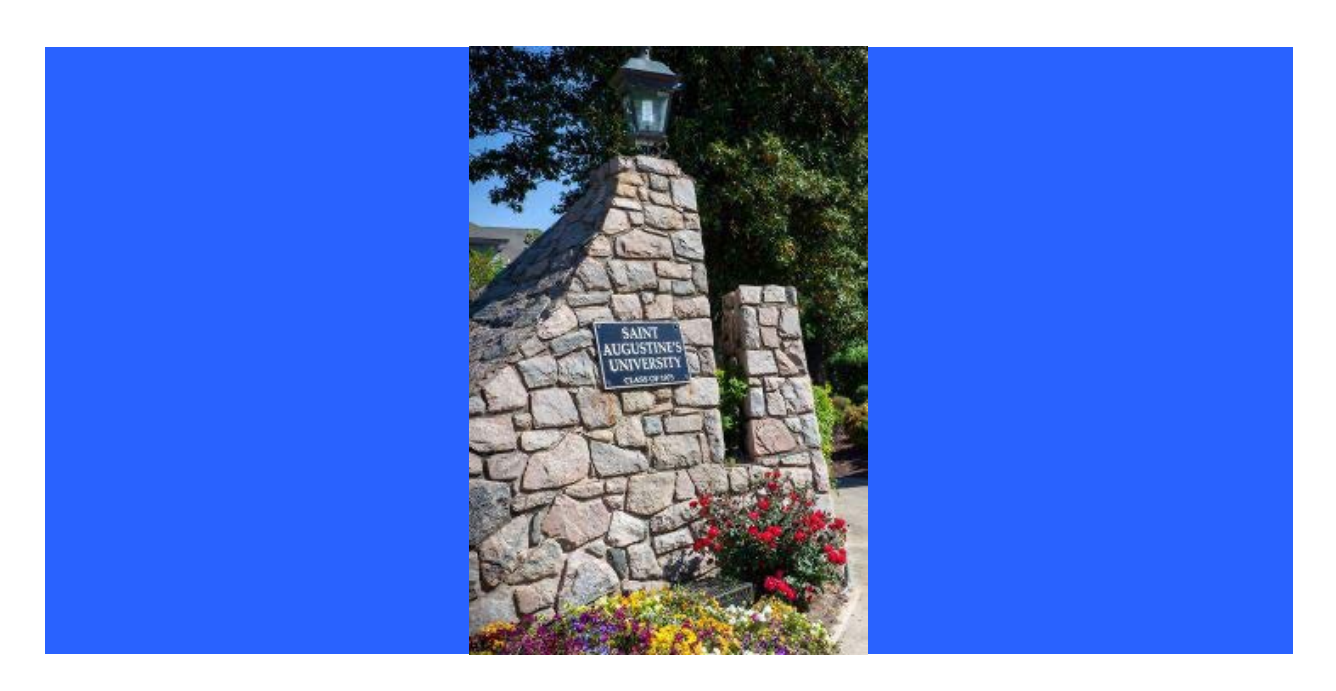
SAU at a Glance

Now, is the time for Chapters to start the discussions on potential officers for the organization. The NAA-SAU is a critical stakeholder in the wellness of Saint Augustine's University, and it is imperative that the organization has the best representation available. Please start identifying candidates early, so when the process begins, your Chapter will be ready. All officers will be elected/re-elected in 2022 to serve for the 2022-2024 term, except the Alumni Trustee.